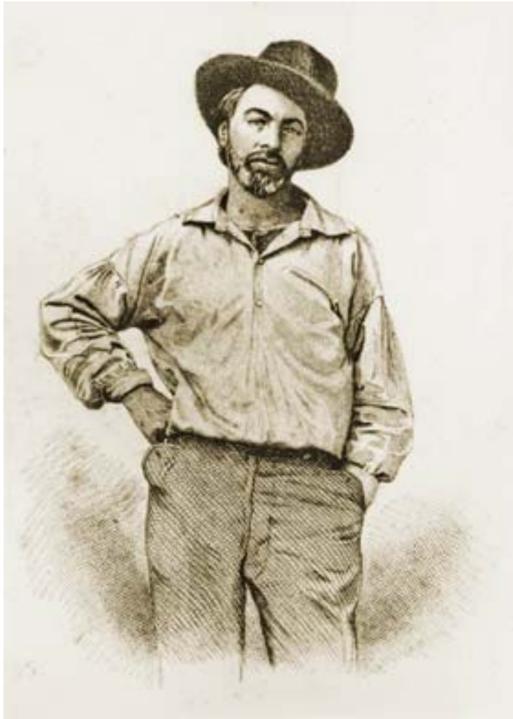
Whitman (above) and his “burial house” (below)